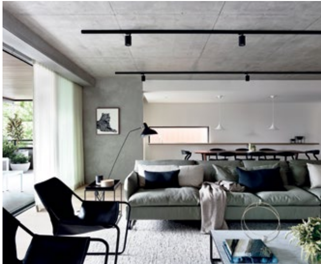
WALSH STREET, SOUTH YARRA, VIC

A respected Australian property development business, Golden Age creates and delivers an improved quality of life with sophisticated living spaces, premium residential amenity and convenient locations. Essence Double Bay is one of three landmark Sydney projects for Golden Age.