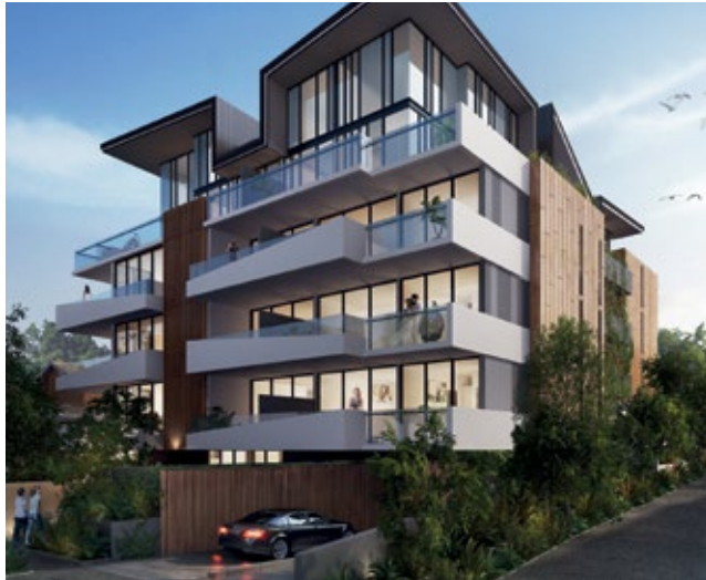
PARK AVENUE, WAITARA, NSW