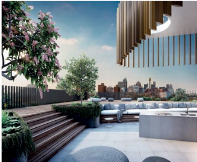
1 LACHLAN STREET, WATERLOO, NSW